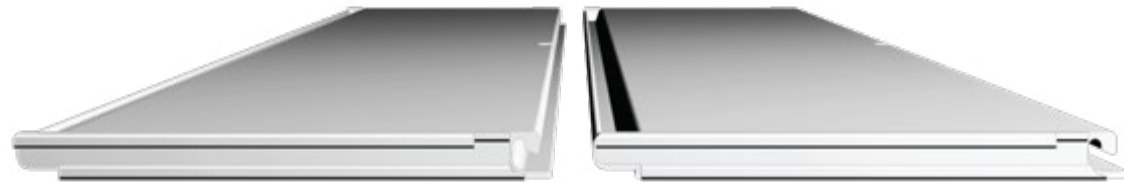
PSA Flat Top Reinforced Trackway®