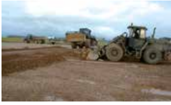
1. Clean debris