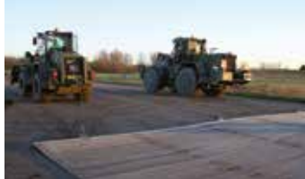
7. Tension mat