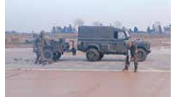
8. Drill and bolt