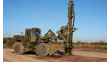
4. Dynamic compaction