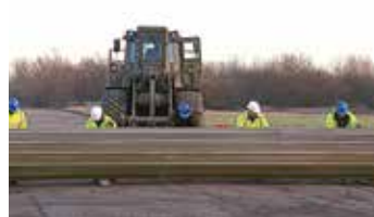
6. BDRM unroll mat