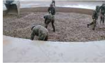
3. Filling in crater