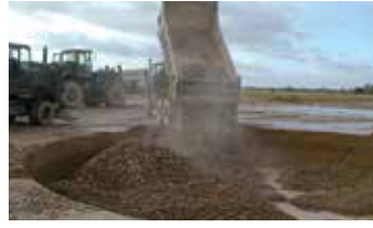
2. Fill crater