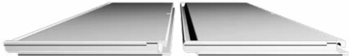
PSA Flat Top Reinforced Trackway®